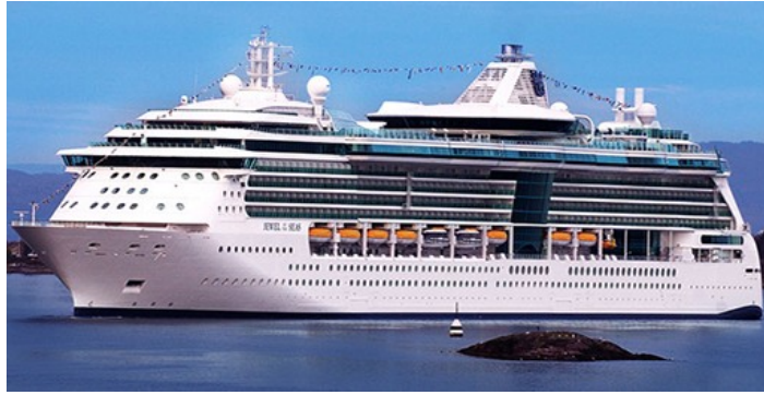
Jewel of the Seas